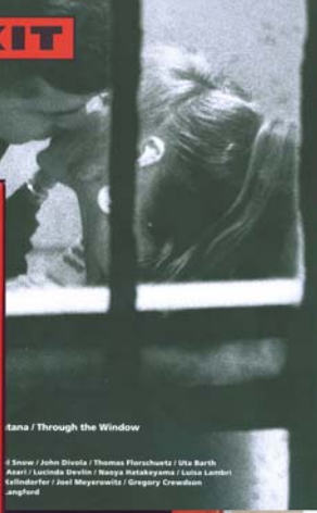
Itana / Through the Window

A TRAVÉS DE LA VENTANA ■ THROUGH THE WINDOW